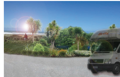
PICTORIAL A Entrance to camping area