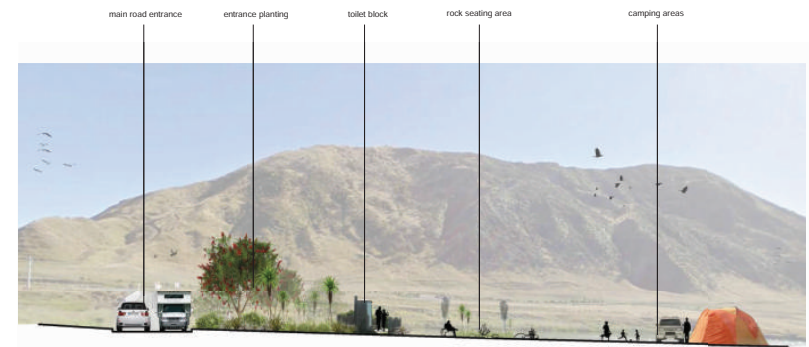
CROSS SECTION A-A NORTH VIEW